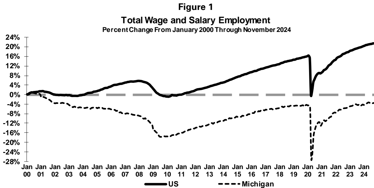
Figure 1 shows the monthly percent change in total wage and salary employment for both the U.S. and Michigan from January 2000 through November 2024.