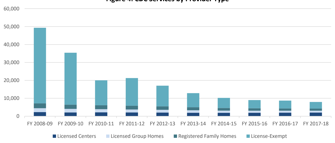
Figure 4: CDC Services by Provider Type

<u>Figure 4</u> shows an overall decrease in the number of providers providing CDC services since FY 2008-09. The largest change has been among License-Exempt Providers, which declined by 91%. This decline is likely due to stricter policies after Auditor General audits<sup>2,3</sup> found that many license-exempt providers and/or families were not meeting program requirements. Licensed Providers saw reductions as well—Licensed Group Homes and Family Homes dropped by approximately 54% and Centers dropped by 12%. However, this was partly due to economic decline during the recessions occurring during the 2000s and early 2010s. A further discussion of these changes is provided in Historical Caseload Statistics and Policy Changes , below.