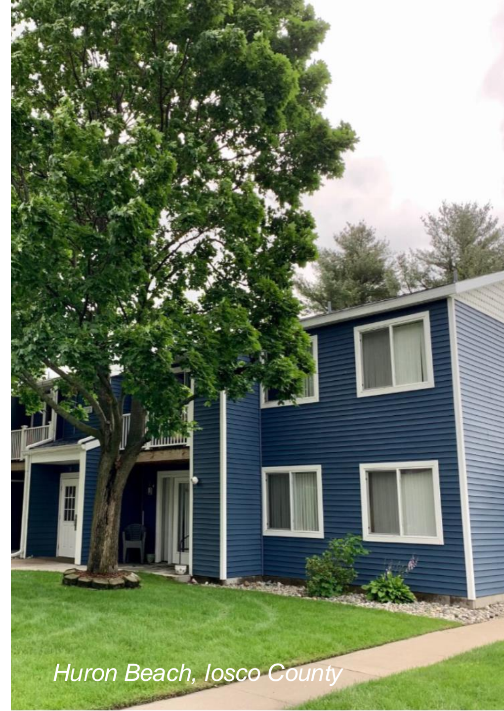
Huron Beach, Iosco County