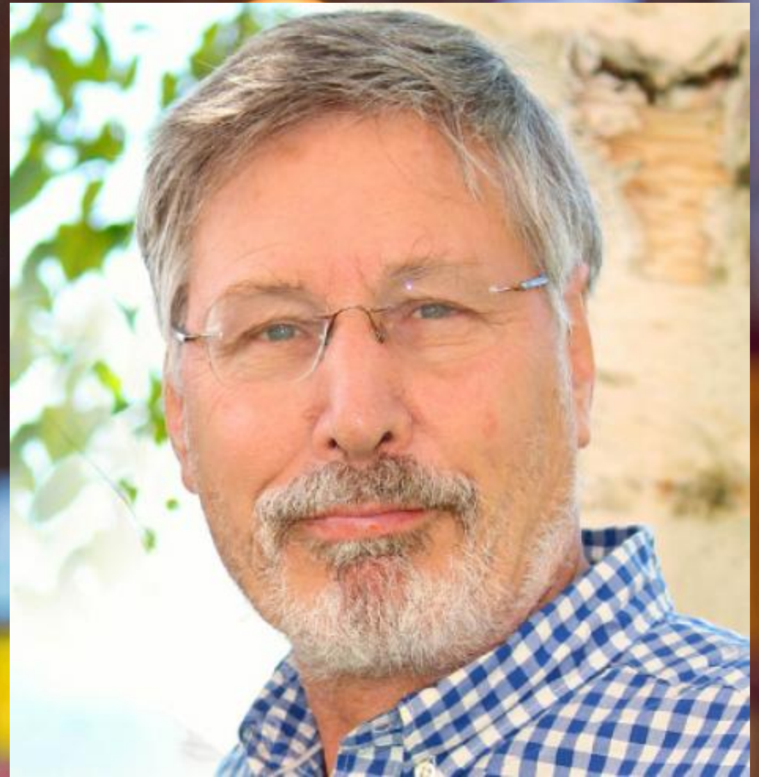
Dr. Bessel van der kolk