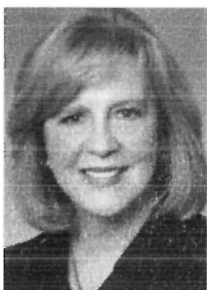
State of Michigan