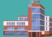
Disproportionate Share Hospitals

(hospitals serving a high percentage of Medicaid patients)