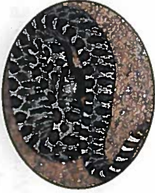
Federally threatened eastern massasauga rattlesnake