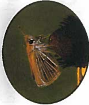
Federally endangered Poweshiek skipperling