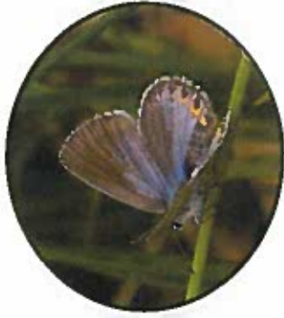
Federally endangered Karner blue butterfly