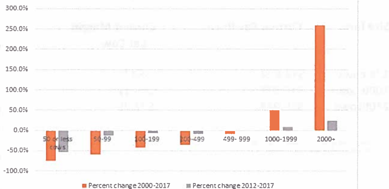
Percent Change in Dairy Farm Numbers by Size