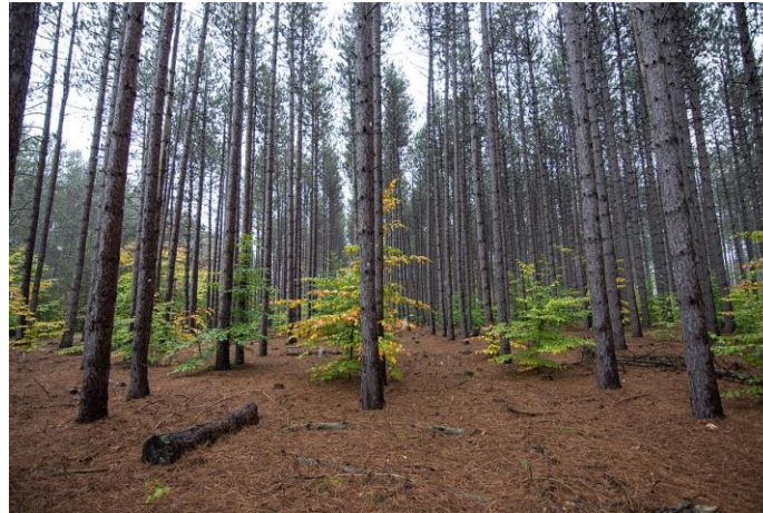
FOR FORESTS, CLIMATE, + SUSTAINABILITY